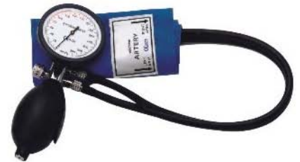
AC-212-70 ABS plastic 50 mm, 2-tube