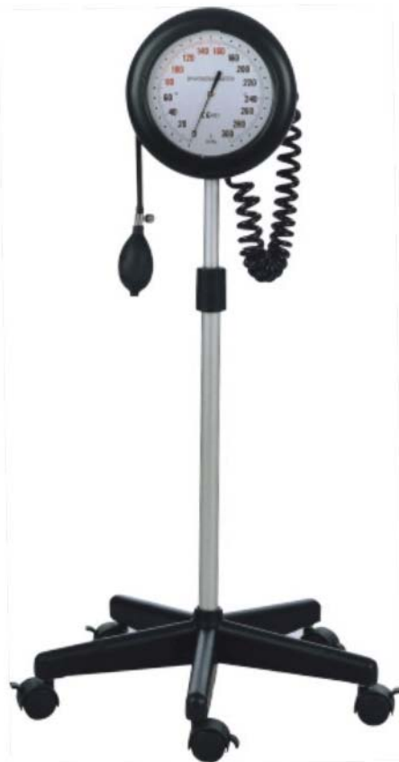
AC-311-60 ABS Round stand type 360 degree manometer swivel 5-wheel metal caster with brake, ABS basket Aluminum tube, adjustable height