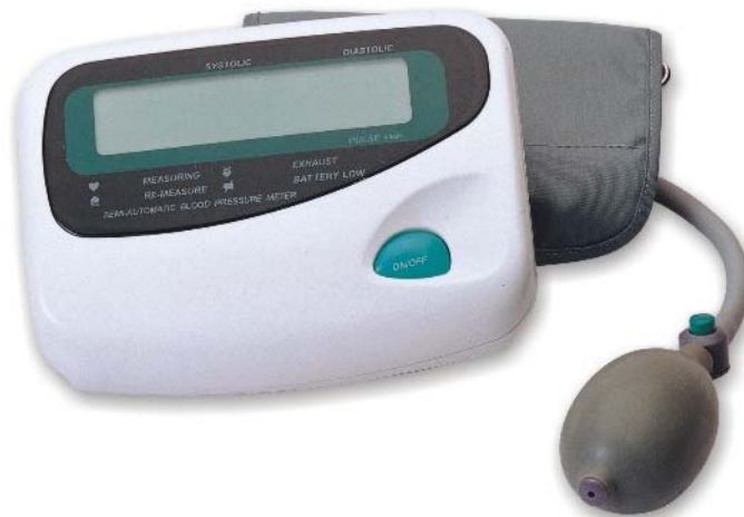
AC-119-20 Semi-automatic electric blood pressure monitor