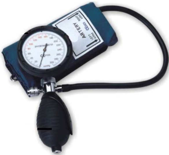
AC-213-80 ABS plastic