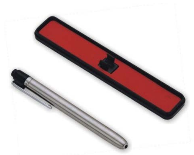
AC-313-40 Stainless steel diagnostic pen light Stainless steel penlight with pocket clip Uses 2 AAA batteries