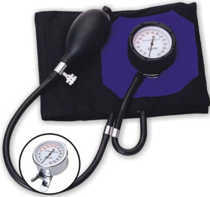
AC-014-00P French Shockproof