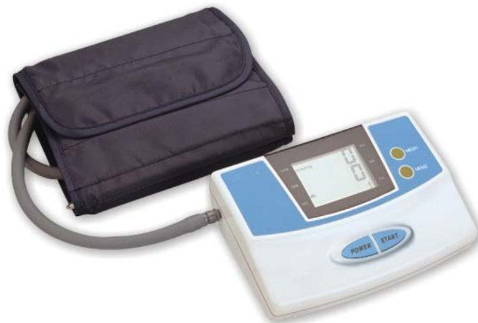
AC-118-20 Automatic electric blood pressure monitor