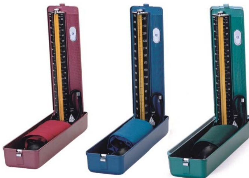
AC-112-00R Standard Red

Glass tube 3mm Standard cotton cuff 2-tube adult size bladder Standard latex bulb Inflation valve Standard end valve Short latex tube with plastic connector (25cm)