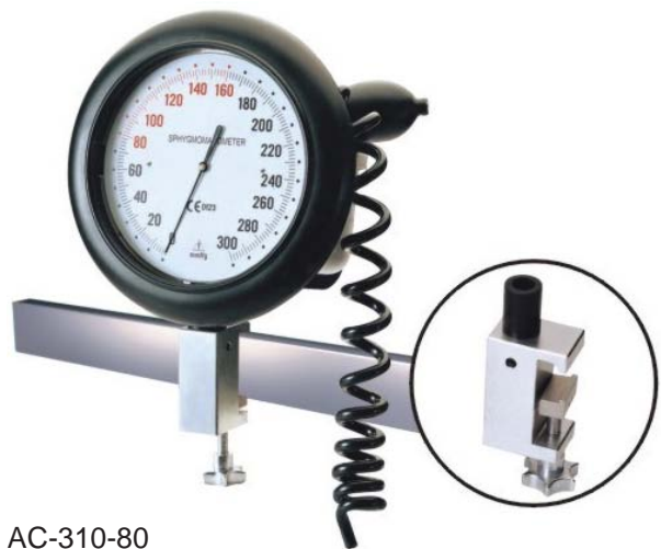
AC-310-80 Rail mounted model

Easy, flexible and quick mounted on standard wall rail in hospitals, clinics and ambulances