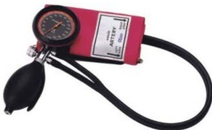
AC-214-50 Zero adjustable, shockproof, 2-tube