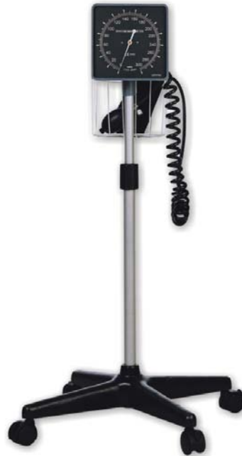
AC-311-30 ABS Square stand type 4-wheel plastic caster with brake, metal basket

Square shaped 14cm diameter dial Front and rear adjustable for easy reading Aluminum tube, adjustable height Cotton cuff with D-ring 2-tube adult latex bladder Standard latex bulb Inflation valve with spring Standard end valve PVC coil tubing