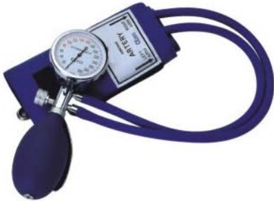
AC-211-10 Metal dial 50 mm, 2-tube