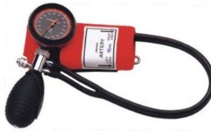
AC-214-70 Zero adjustable, Left/right hand, shock proof, 2-tube