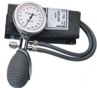
AC-215-30 Laser imprint dial, Left/right hand, 2-tube