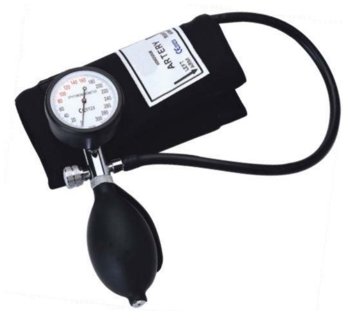
AC-213-00 Powder coated

ABS plastic case 65mm diameter dial Zinc alloy with black powder coating large handle Calibrated nylon cuff 1-tube adult size bladder Flat latex bulb Cotton carrying case Large size end valve