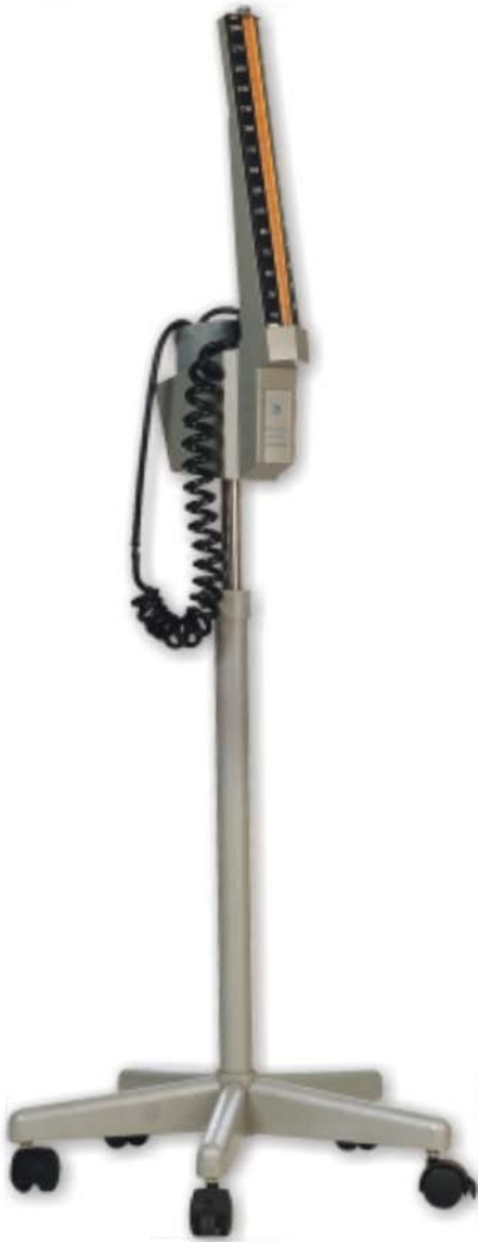
AC-115-00 Stand Metal castor and tube, adjustable height