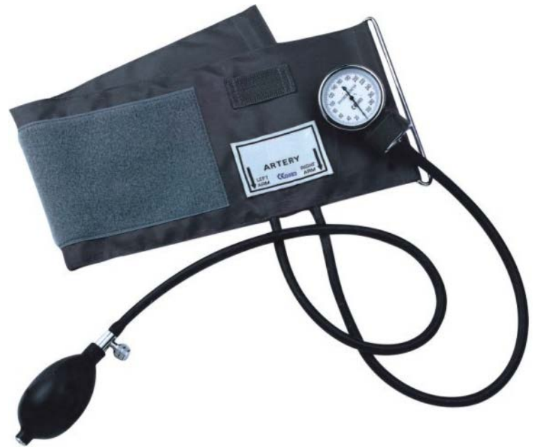
AC-012-40 D-ring cuff

Nylon cuff with D-ring Non-stop pin manometer 2-tube adult size bladder Standard latex bulb Special vinyl zipper case Inflation valve with spring Standard end valve