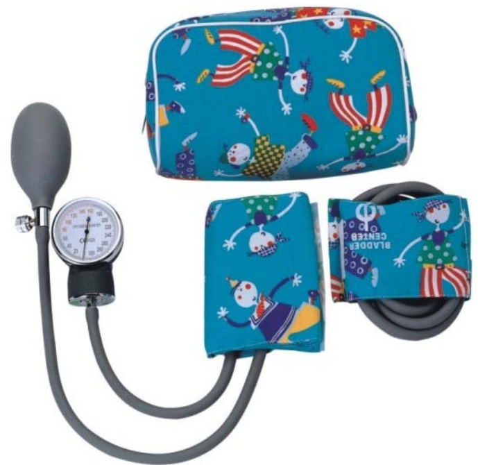
AC-013-00 Pediatric Latex free, Separate cuffs for new born and child

Nylon cuff with D-ring Non-stop pin manometer 2-tube adult size bladder Standard latex bulb Special vinyl zipper case Inflation valve with spring Standard end valve