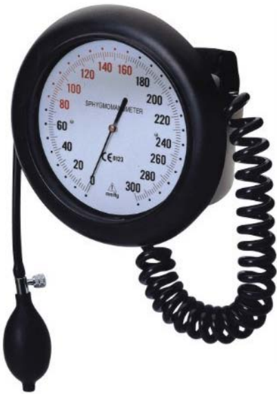
AC-310-60 ABS wall type with ABS basket 180 degree swivel for easy reading Basket in the back, adjustable left/right