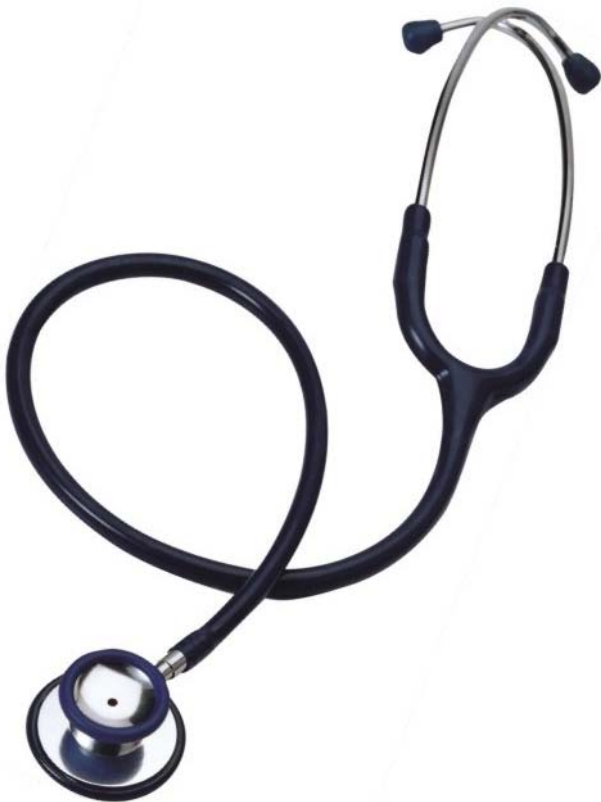
AC-521-00 Dual head stethoscope - Deluxe For adult, aluminum head with non-chill rings Standard tubing, Head diameter 47mm Special design binaural for suiting ear structure with inner spring binaural tubing assembly