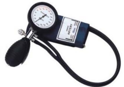
AC-214-10 Left/right hand, shock proof, 2-tube