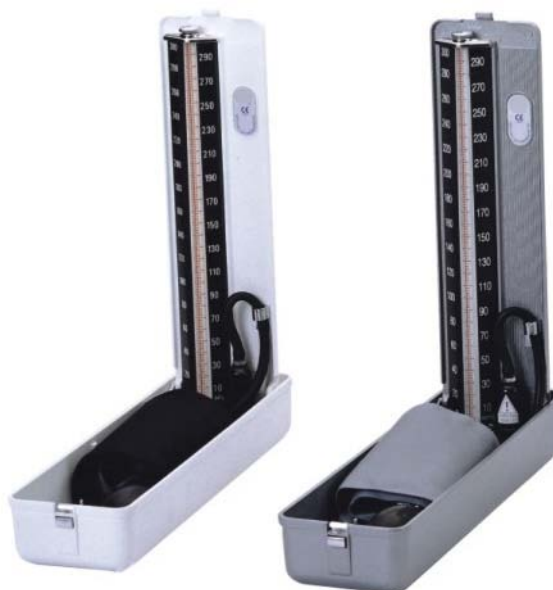
AC-110-00W Economy White