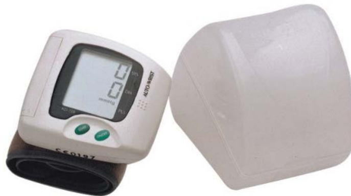
AC-117-20 Automatic wrist electric blood pressure monitor