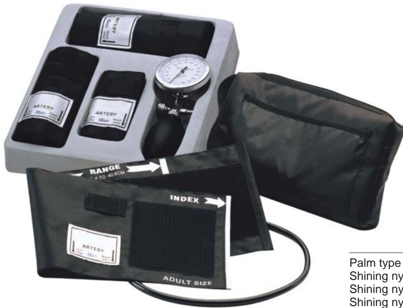
AC-019-00 Sphygmomanometer set

Palm type manometer Shining nylon calibrated cuff child Shining nylon calibrated cuff adult Shining nylon calibrated cuff large adult 1-tube bladder for child 1-tube bladder for adult 1-tube bladder for large adult Standard latex bulb Shining nylon carrying case Standard end valve