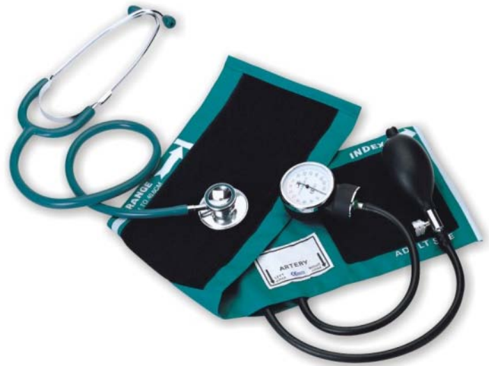
AC-018-40 Kit with dual head stethoscope

Calibrated nylon cuff Non-stop pin manometer 2-tube adult size bladder Standard latex bulb Nylon carrying case Deluxe valve with spring End valve with dust filter Dual head stethoscope