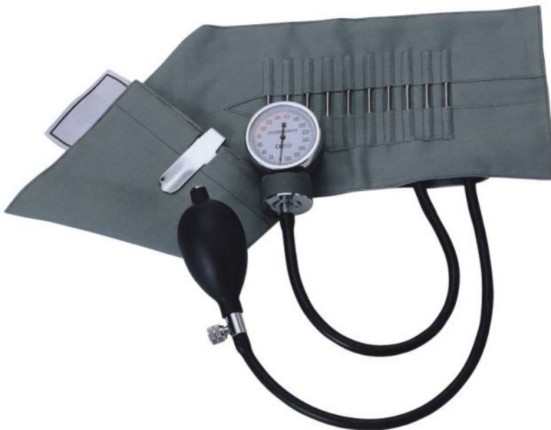
AC-017-20 Metal hook cuff

Metal chip cotton cuff Non-stop pin manometer 2-tube adult size bladder Standard latex bulb Special vinyl zipper case Inflation valve with spring Standard end valve