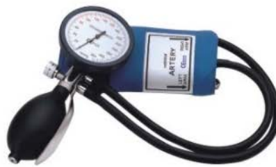
AC-213-90 ABS plastic 65 mm, 2-tube