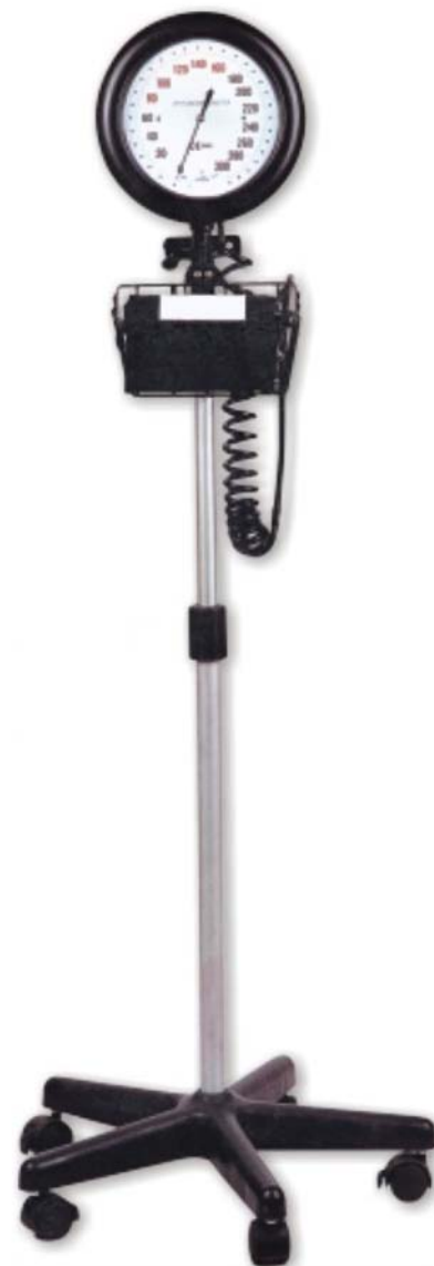
AC-311-40 ABS Round stand type 5-wheel metal caster with brake, metal basket Aluminum tube, adjustable height

Round shaped 15cm diameter dial Special precise mechanism 360 degrees manometer swivel for easy reading Front and rear adjustable Adult cylinder shaped cuff 2-tube adult PVC bladder PVC bulb Inflation valve with spring Standard end valve PVC coil tubing