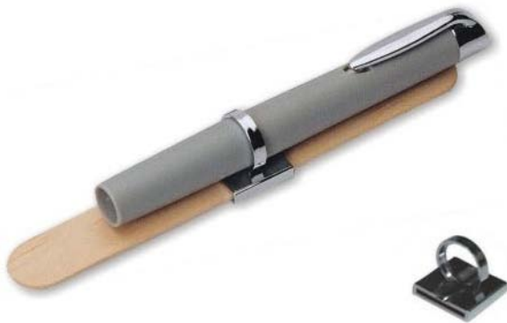
AC-313-30 Penlight with clip for tongue depressor Easy examination with single handed use

Diagnostic pen light with pocket clip Uses 2 AAA batteries