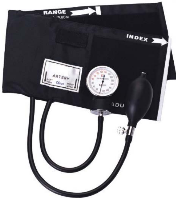
AC-012-20 Calibrated Cuff