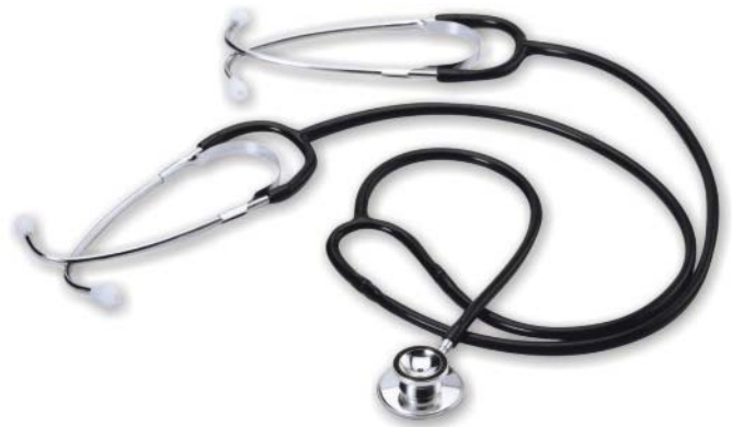
AC-525-00 Dual head stethoscope for teaching use With two binaural and one dual head