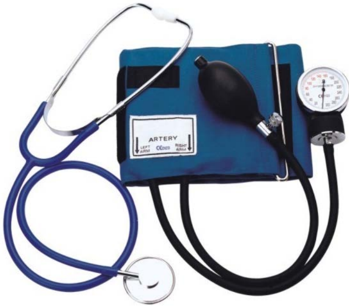
AC-018-00BU Home use blood pressure kit