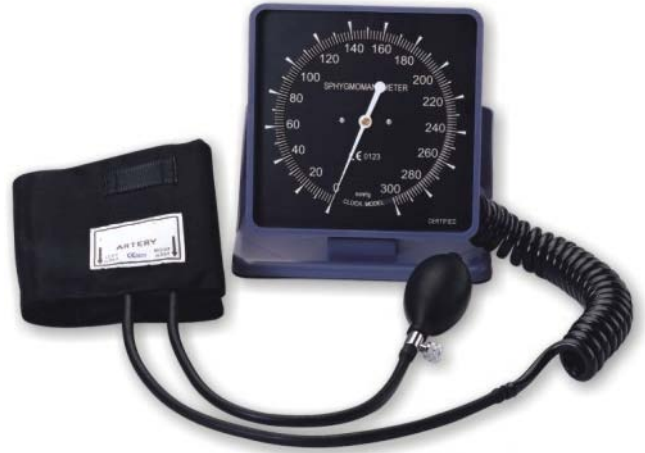
AC-310-00 ABS Desk/Wall Type

Square shaped 14cm diameter dial Front and rear adjustable for easy reading Standard cotton cuff 2-tube adult latex bladder Standard latex bulb Inflation valve with spring Standard end valve PVC coil tubing