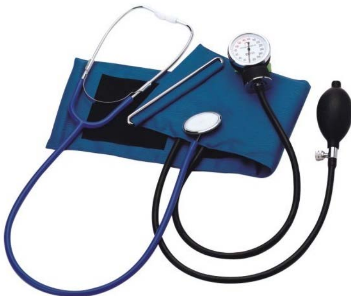
AC-018-20 Home use blood pressure kit