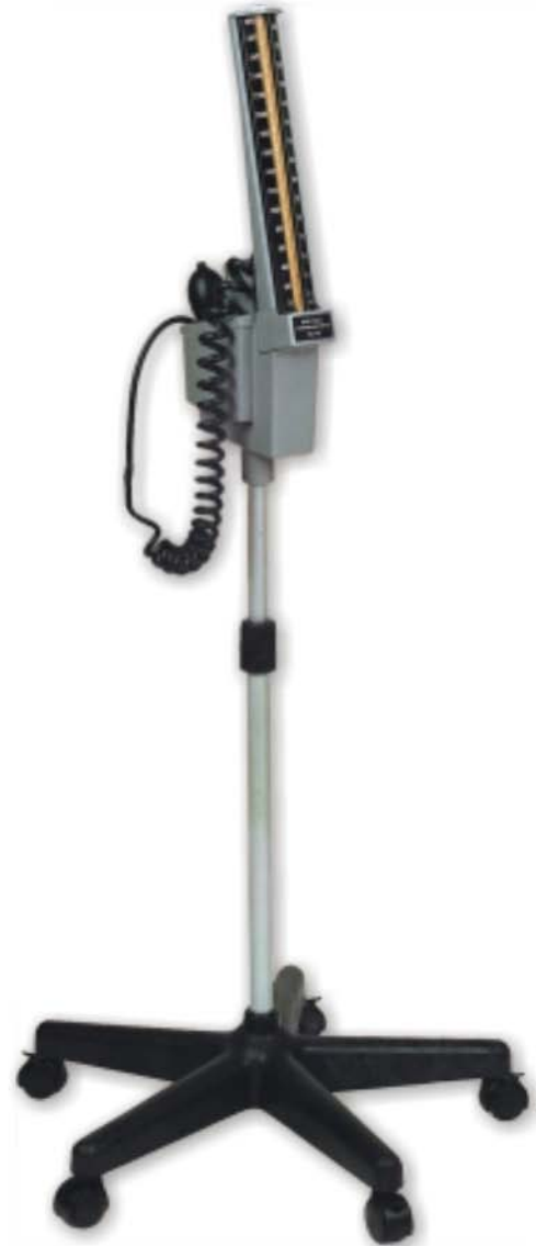
AC-116-00 Stand Plastic castor, aluminum tube, adjustable height

Glass tube 3-5mm 5-wheel with break Cotton cuff with D-ring 2-tube adult latex bladder Standard latex bulb Inflation valve with spring Standard end valve PVC coil tubing