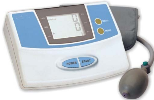
AC-119-00 Manual electric blood pressure monitor