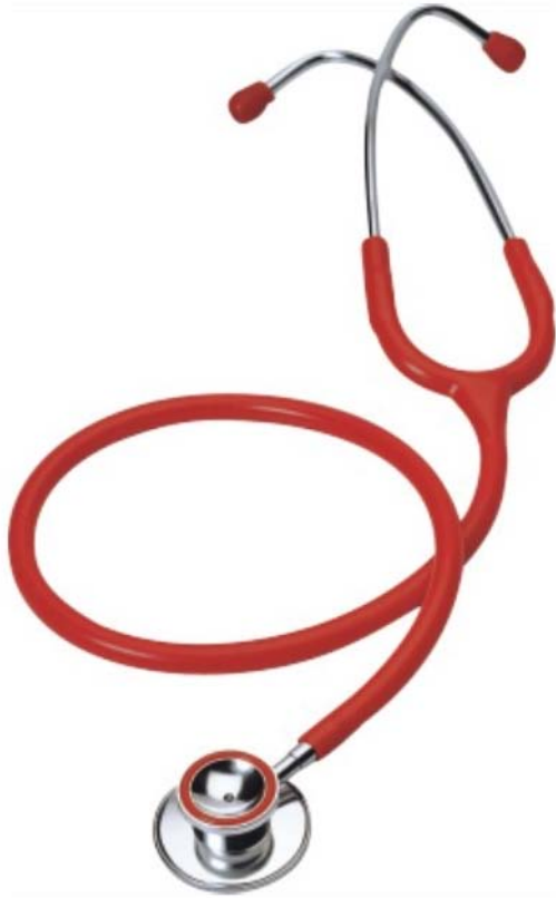
AC-520-00 Dual head special type stethoscope For adult Special design binaural for suiting ear structure with inner spring binaural tubing assembly