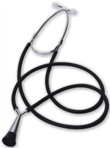
AC-422-00 Fetal stethoscope For use during pregnancy