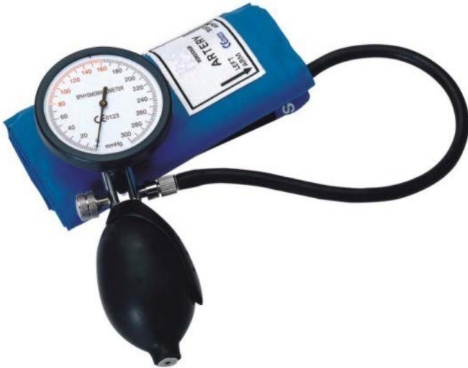
AC-212-60 ABS plastic

ABS plastic case 65mm diameter dial Zinc alloy with black powder coating large handle Calibrated nylon cuff 1-tube adult size bladder Flat latex bulb Cotton carrying case Large size end valve