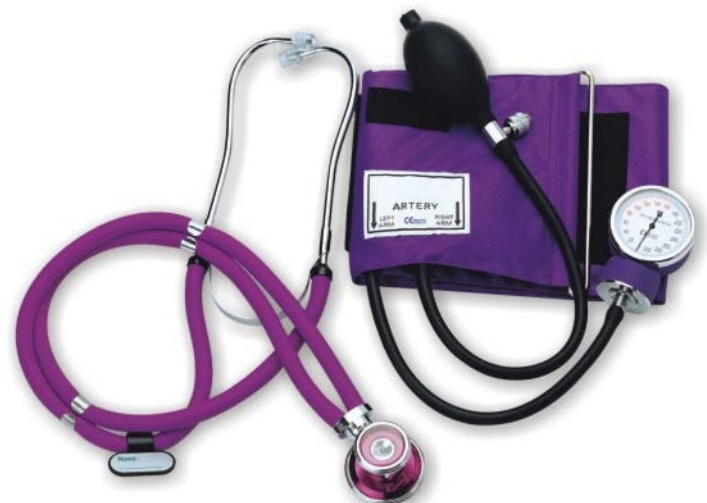
AC-018-60 Kit with rappaport stethoscope

Calibrated nylon cuff Non-stop pin manometer 2-tube adult size bladder Standard latex bulb Nylon carrying case Deluxe valve with spring End valve with dust filter Dual head stethoscope