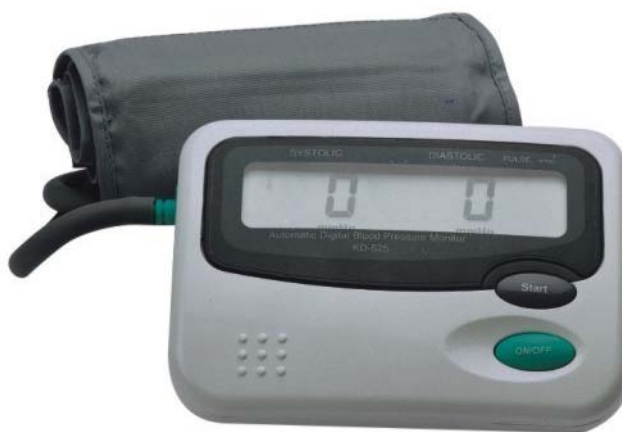
AC-118-00 Automatic electric blood pressure monitor