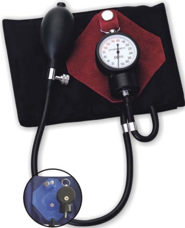
AC-014-20R Button Cuff Easy to wash

Cuff with leather attachment Chrome-plated manometer Rubber protective ring Standard latex bulb Special vinyl zipper case Inflation valve with spring Standard end valve