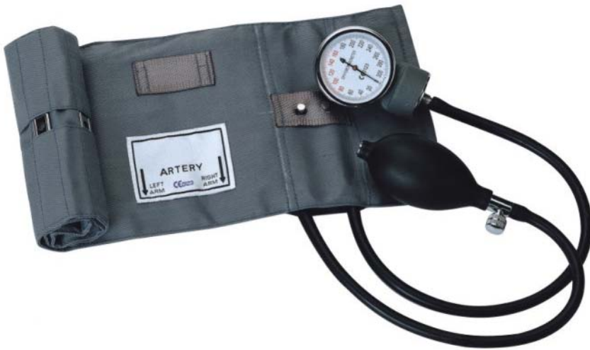
AC-017-00 Metal chip cuff

Metal chip cotton cuff Non-stop pin manometer 2-tube adult size bladder Standard latex bulb Special vinyl zipper case Inflation valve with spring Standard end valve