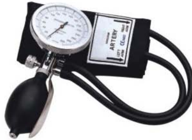
AC-212-50 Plastic dial 65 mm, 2-tube