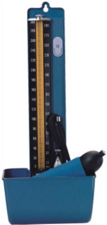
AC-113-00 Wall standard

Glass tube 3-5mm Basket for cuff (large) Cotton cuff with D-ring 2-tube adult latex bladder Standard latex bulb Inflation valve with spring Standard end valve Short latex tube with plastic connector (25cm)