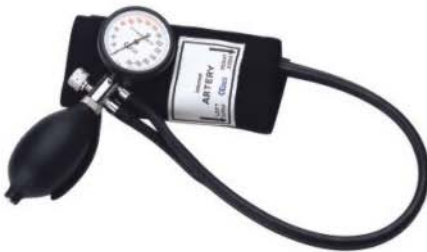
AC-213-10 Powder coated, 2-tube