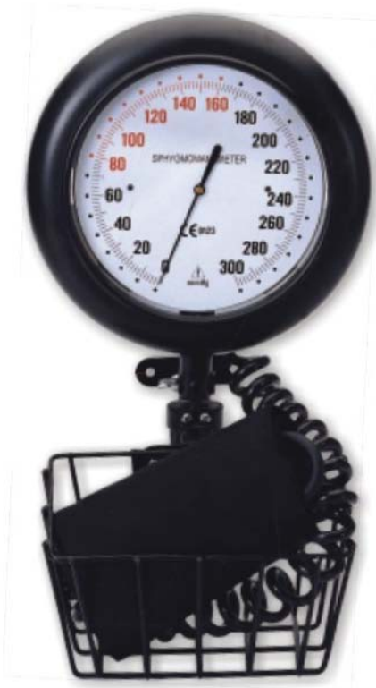
AC-310-40 ABS wall type with metal basket

Round shaped 15cm diameter dial Special precise mechanism 360 degrees manometer swivel for easy reading Front and rear adjustable Adult cylinder shaped cuff 2-tube adult PVC bladder PVC bulb Inflation valve with spring Standard end valve PVC coil tubing