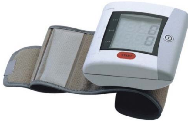
AC-117-00 Automatic wrist electric blood pressure monitor