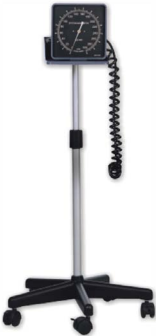
AC-310-10 ABS Square stand type 5-wheel metal caster with brake, plastic basket