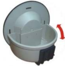
Wall mountable basket