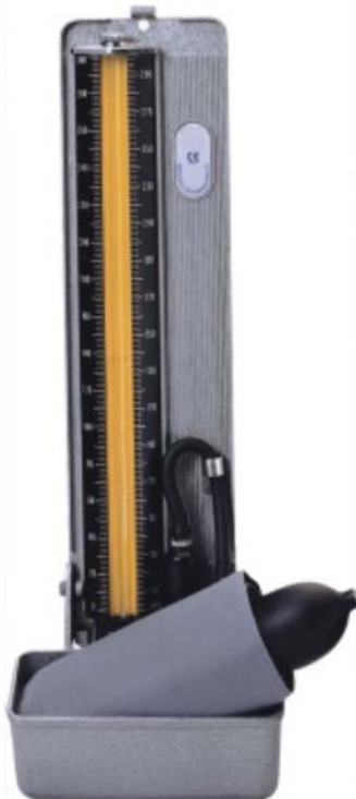
AC-114-00 Wall Economy

Glass tube 3-5mm Basket for cuff (large) Cotton cuff with D-ring 2-tube adult latex bladder Standard latex bulb Inflation valve with spring Standard end valve Short latex tube with plastic connector (25cm)