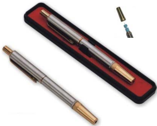
AC-313-80 Stainless steel lancet pen

Strong elastic strap Easy to use plastic lock with gradual release & one-button instant release